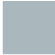
Light Gray 122