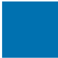
Safety Blue 450